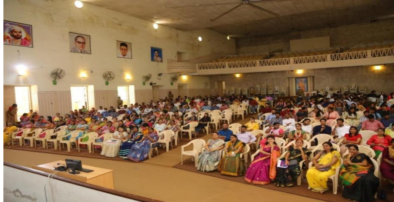
Gathering of Alumni ,Ex- staff, Teaching and Non-teaching staff of KMICS in Sardar Patel Hall.

The inauguration ceremony was carried as per the institute tradition by a prayer song accompanied with lighting the lamp by the dignitaries and Alumni on the dais with the spirit of enhancing knowledge.